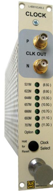
CLOCK SOURCE MODULE PN L-6001-CLK6-2